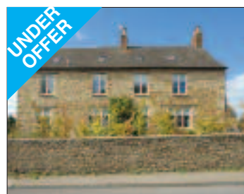
Stinchcombe Guide Price £610,000 An impressive 4/5 bedroom farmhouse with 1.07 plot and character features.