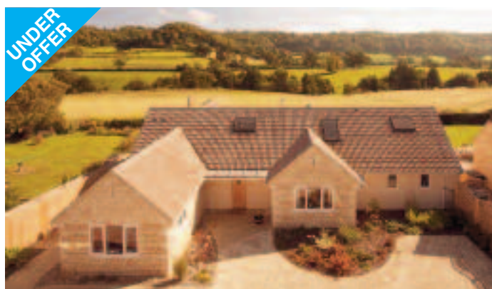
Uley Guide Price £575,000 Positioned in an Area of Outstanding Natural Beauty, commanding breathtaking views, lies this 5 bedroom detached home.