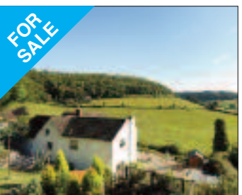
Uley Guide Price £475,000 A 6 bedroom detached family residence with stunning panoramic views. (Rear)