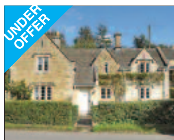
Stinchcombe Guide Price £430,000 A Grade II listed home occupying a village setting with landscaped gardens.

Mr and Mrs E in rented require a detached house with 2/3 reception rooms and large garden/garage. Funds available £550,000. Ref: STR090520