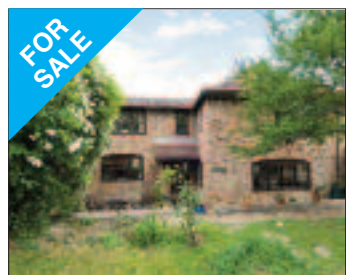
Slimbridge Guide Price £345,000 A charming four bed Grade 2 Listed property with many character features.