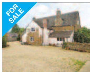
Cam, Dursley Guide Price £650,000 An 4/6 bedroom Grade II listed detached farmhouse, set in 1.197 acres. (Rear)