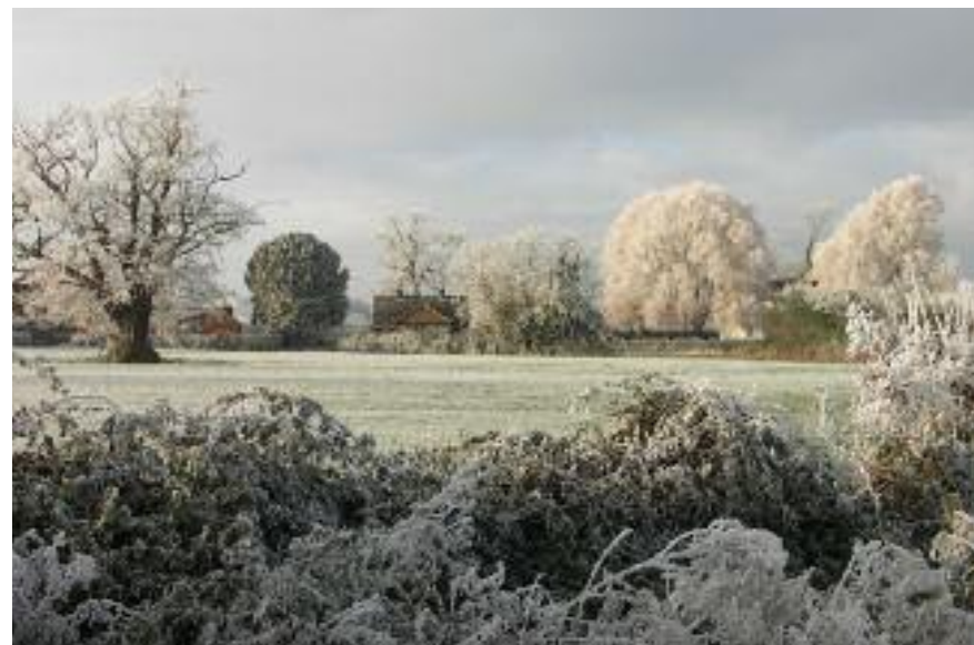
Local scene December 2010

A transformer pole in field 6697 behind the allotments on The Ham has been responsible for the electrocution of some birds. The pole has some redundant metal work attached to it, close to live wires. Somehow birds are able to touch the live parts and are being killed as a result. While this is distressing it cannot be rectified immediately. Western Power is aware of the problem and is hoping to deal with the issue next spring. Unfortunately outages have to be planned well in advance and are for specific work on specific lines. With winter approaching it is vital to safe guard people's electricity supply and so the work will be carried out when the threat of bad weather has lessened, probably around March. If removal of the problematic metal work proves not to be possible then some form of bird scaring devices will be attached to the lines.