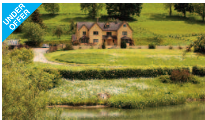
Uley Guide Price £1,400,000 A substantial detached residence set in a stunning elevated rural position with 40 acres including pasture land and lake.