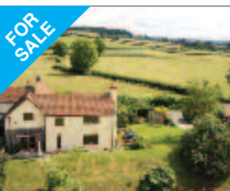
Nr. Berkeley Guide Price £385,000 A beautifully presented 4 bedroom semi detached period cottage with super views.