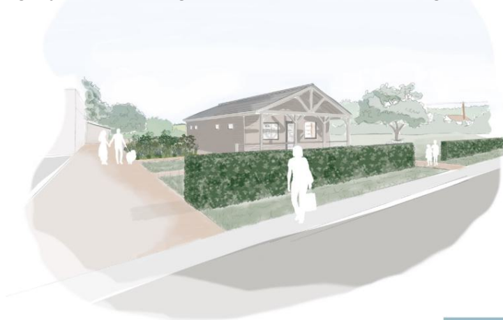
Coaley Recreation Ground: Proposed hedge at maximum height of 5ft (height of current chain-link fence). Actual hedge to be kept lower

The additional benefits of the hedge are that it aligns with our Bio-diversity